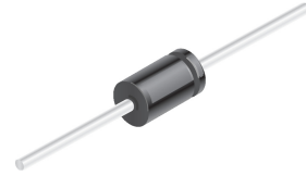
AXIAL LEAD (DO-35) CASE 017AG (Color Band Denotes Cathode)

ABSOLUTE MAXIMUM RATINGS ( T_A = 25^\circ\text{C} unless otherwise noted) (Notes 1, 2, 3)