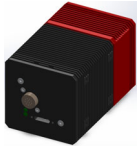
CMOD 99.74x61.00x61.00 CASE 810AB ISSUE A