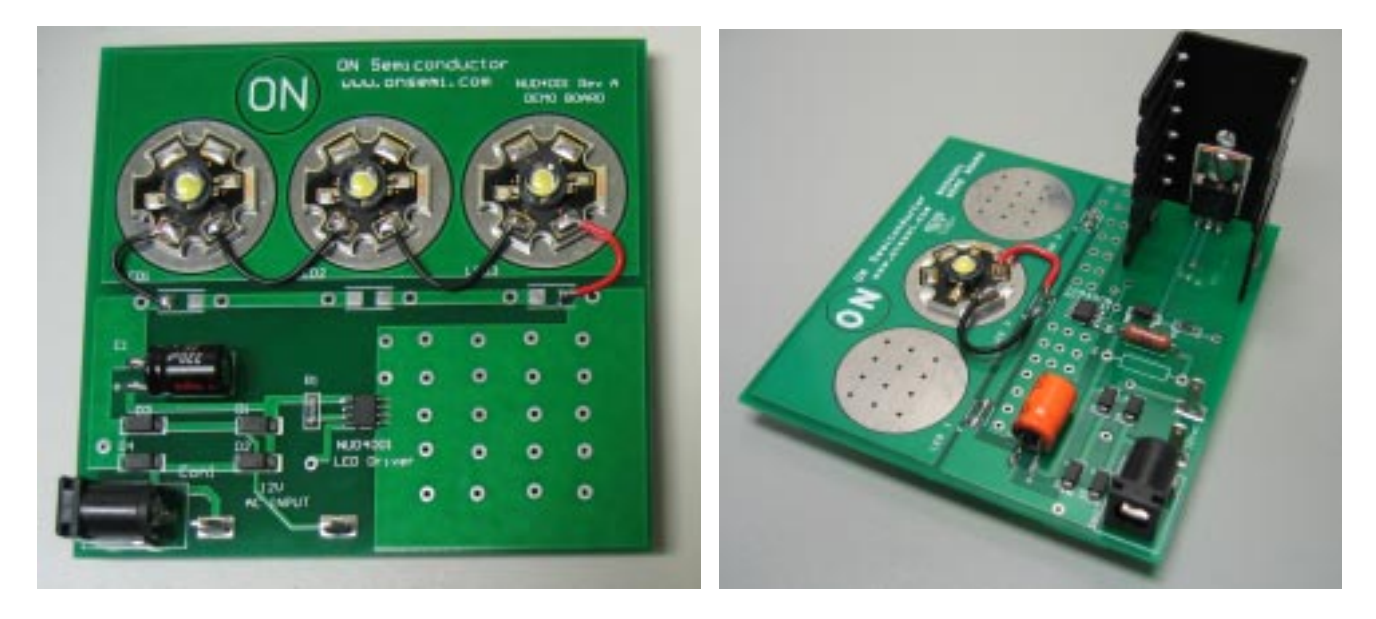
Figure 3. Picture of Finished Demo Board A